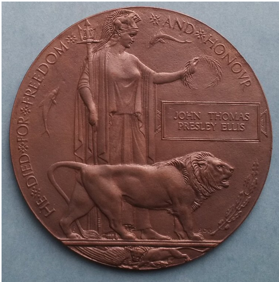
The Death Penny